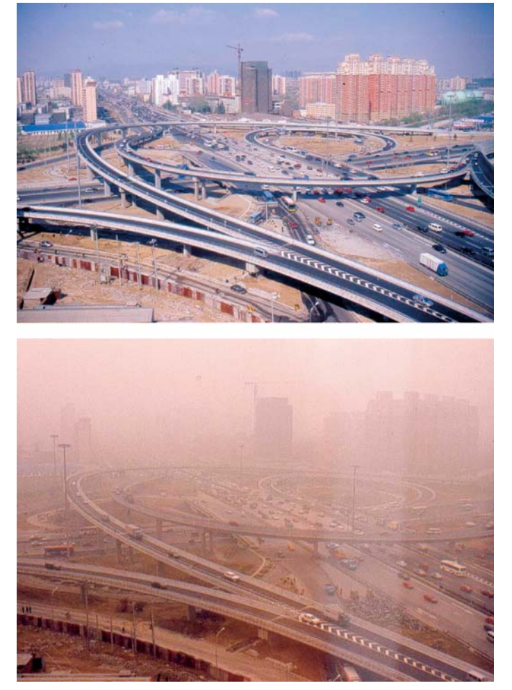
Figure 3. Before and during a Mongolian dust pall over Beijing, April 2003.

The impact of airborne mineral dust may be exacerbated by the presence within fine dust particles of bacteria, fungi, and other microorganisms (13). The global extent of the fine dust transport system has been implicated in intercontinental transport of microorganisms with the potential to damage plants and animals, including human subjects (14–16). Although susceptible to destruction by ultraviolet radiation, a proportion of the included microorganisms may survive in cavities and cracks within suspended dust particles. Deteriora-