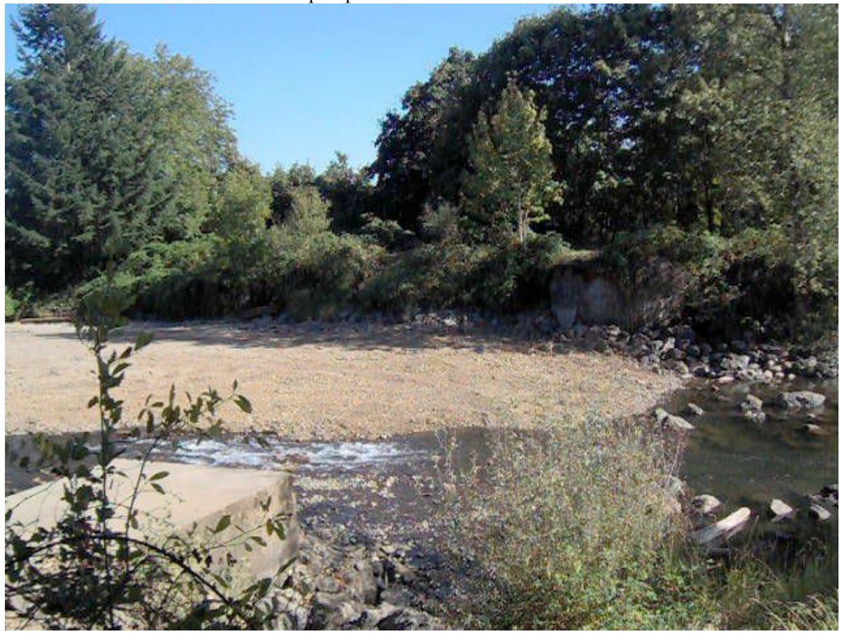
Brownsville Dam Removed September 7, 2007 – Day 9 of construction

Brownsville Dam September 5, 2007 – Day 7 of construction Entire upstream and downstream walls of dam removed. Ecoblocks in place dewatering site. Pump in place to dewater work area.