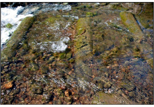
Large timbers with rebar and other wood remnants were encountered in the streambed and gravel bar.

During completion of the north-side notch in the dam and placement of the cement blocks, large timbers with rebar and other wood remnants were encountered in the streambed and gravel bar (Photograph 8). The CWC notified the SHPO of the remnants and requested information on their disposition. At the request of SHPO and CWC, CES photographed and mapped the remnants prior to continued work. As directed, remnants were left in place except where they directly hindered the completion of the dam removal. It was not determined whether the remnants were related to the original wood crib dam or to a later construction. A copy of the remnant location map is included in Appendix C.