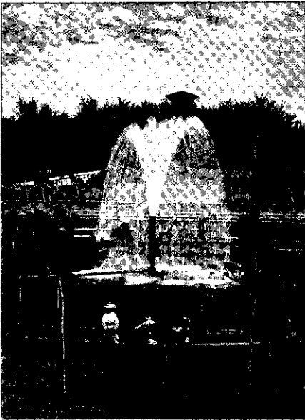
ARCHEAN WELL AT PRAIRIE DU CHIEN, WISCONSIN.

U. S. GEOLOGICAL SURVEY FIFTH ANNUAL REPORT PL. 33D