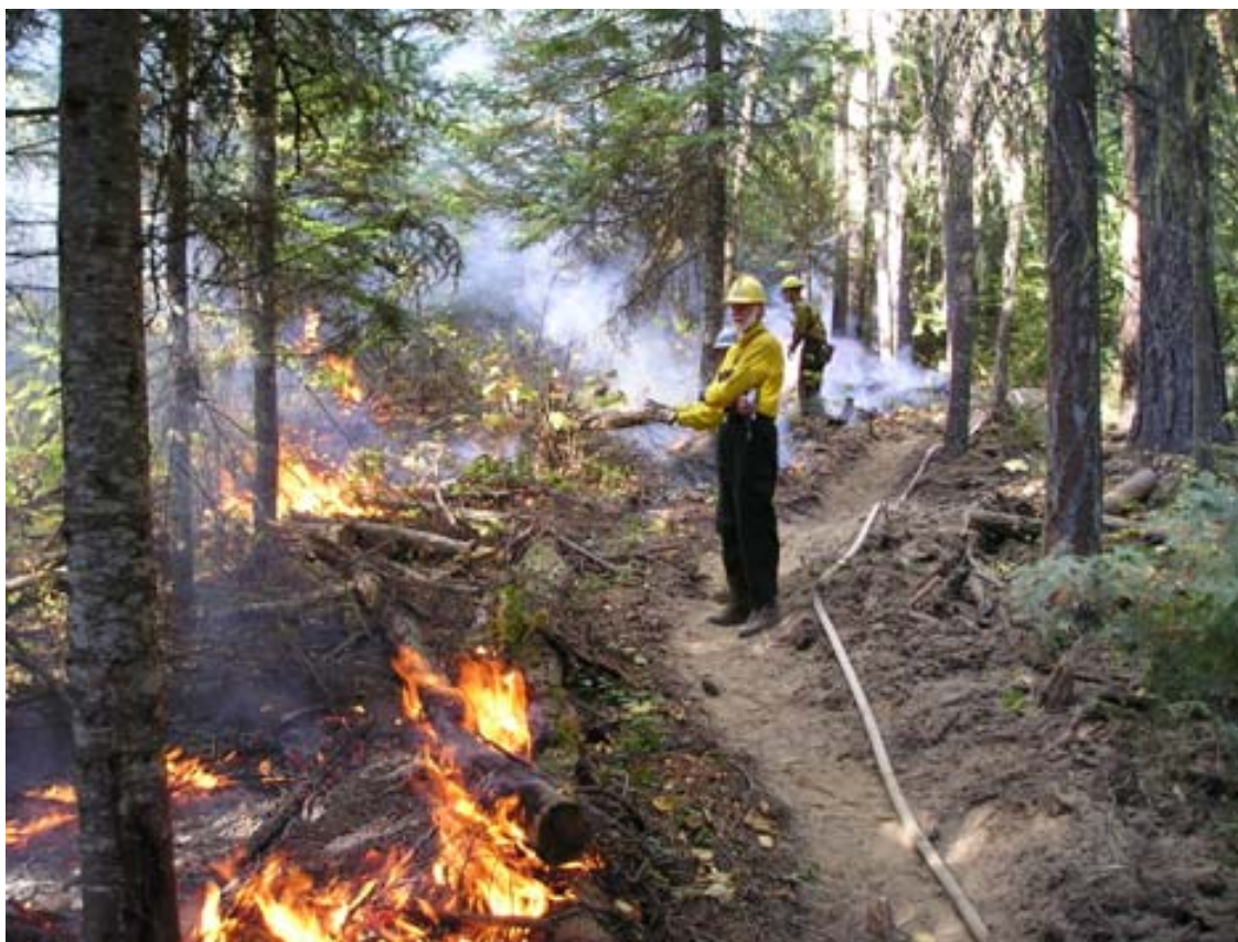
Figure 2. Fire line around a prescribed burn to reduce ground fuel loads.

In the past decade, management of federal forests has focused on fuel management to reduce the risk of high severity wildfire (Agee and Skinner, 2005). State and privately owned forests, and some federal forests still continue to harvest timber for sale, but in all cases, much greater consideration is given to forest and watershed health (Karwan et al., 2007). The most common fuel management practices are thinning, particularly to remove the understory, and the use of prescribed fire (Figure 2). Recent studies have shown that these practices do not necessarily reduce the likelihood of a wildfire occurring, but they tend to reduce the severity of the fire (Reinhardt et al., 2008). Erosion from thinning will be similar to the undisturbed forest, whereas erosion from the prescribed fire is typically increased by a factor of 10 in the year following the treatment.