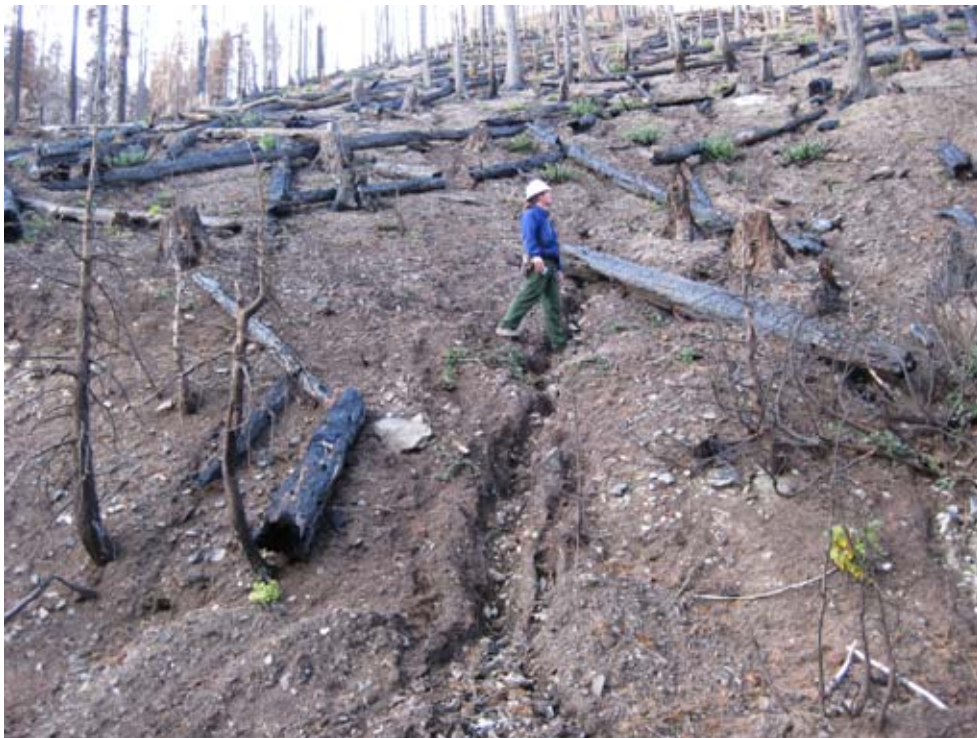
Figure 1. Severe rill erosion following wildfire.

KEYWORDS. Forest fire, Forest roads, Slope stability, WEPP.