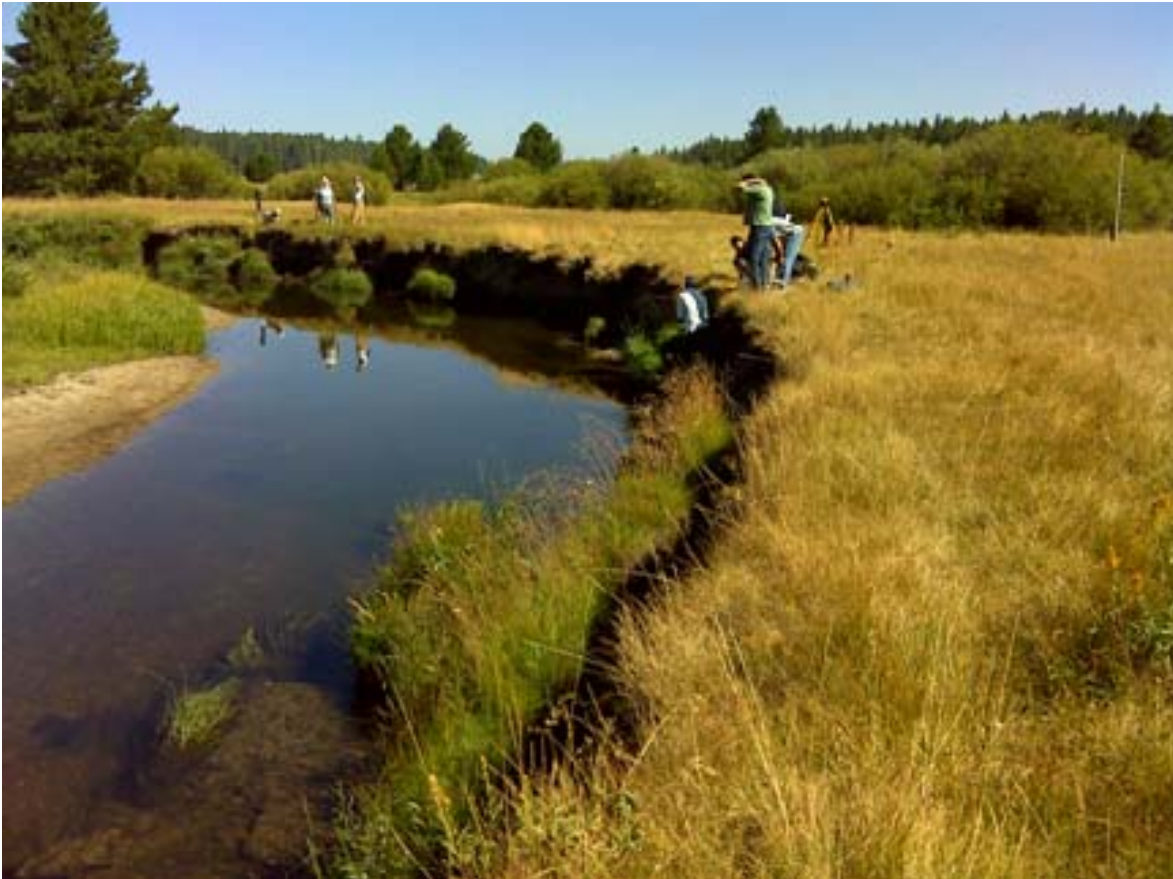
Figure 4. Toppled banks along a forest meadow stream (Source: W. Elliot).

Stream bank erosion is also driven by larger flow events. Bank erosion is frequently much greater from mass failure when the toe of a bank is undercut by channel erosion, followed by a period of high flow which can saturate the bank, and then a drop in flow, leaving the bank weakened by saturation and unstable from undercutting (Elliot et al., 2010). The bank will then topple into the stream (Figure 4), and gradually the blocks will be eroded and the sediment transported downstream during high flows. When channels or banks are not disturbed, channels will reach an equilibrium condition. This process may take years following many of the above disturbances. Until it reaches equilibrium, the channel will tend to be a source of additional sediment.