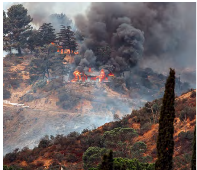
La Tuna wildfire in Los Angeles, CA in 2017

In the immediate aftermath of wildfires, the burnt soil is bare and dark, and highly susceptible to erosion,