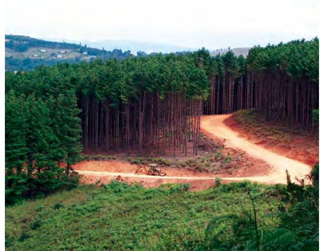
Pine plantation in South Africa

Plantation forests are becoming increasingly common and represent approximately 7% of the world's total forest area (Payn et al., 2015; FAO, 2015). Highly managed conditions, which include stand fertilisation, thinning, regular tree spacing, genetically improved growing stock, controlled burning and other practices, are designed to increase the growth rate and wood quality (Fox et al., 2004). Management practices increase growth by maximizing leaf area and growth efficiency (Waring, 1982). Increased leaf area can increase water demand by trees (Scott et al., 2004).