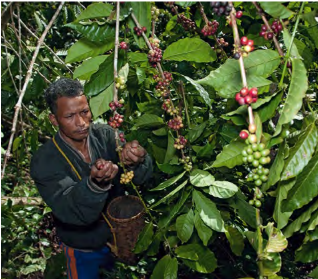
Coffee is a commodity of the Wae Rebo people in East Nusa Tenggara, Indonesia. Their coffee plants are directly adjacent to natural forests