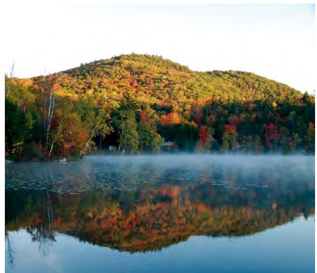
Mirror Lake near Hubbard Brook Experimental Forest (West Thornton, New Hampshire, US)

Forest vegetation succession provides strong negative feedbacks that make permafrost resilient to even large increases in air temperatures. However, as seen in boreal forests of Alaska, climate warming is associated with reduced growth of dominant tree species, plant disease and insect outbreaks, warming and thawing of permafrost, drying of lakes, increased wildfire extent, and increased post-fire recruitment of deciduous trees. These changes have reduced the effects of upland permafrost on regional hydrology (Chapin et al., 2010). Surface water, in contrast, provides positive feedbacks that make permafrost vulnerable to thawing even under cold temperatures (Jorgenson et al., 2010). In watersheds with low permafrost, base flow is higher, and annual water yield varies with summer temperature, whereas in watersheds with high permafrost, annual water yield varies with precipitation (Jones and Rinehart, 2010). With climate warming and loss of permafrost, stream flows will become less responsive to precipitation and headwater streams may become ephemeral (Jones and Rinehart, 2010).