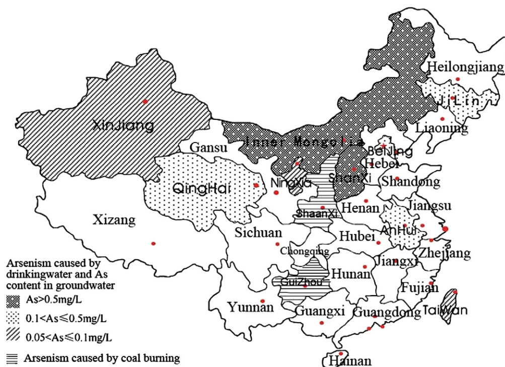
Fig. 1. Map showing the areas distributing endemic arsenism in China (after Xia and Liu (2004), and Jin et al. (2003)).

transfer and transportation, exposure paths and adverse health impacts of the three elements have been conducted since the 1970s in China. However, some of the research outcomes are not well known in the international scientific communities because most of the documents were published in Chinese journals, especially in the 20th century. The monograph of "The Atlas of Endemic Diseases and Their Environments in the People's Republic of China" (Tan, 1989) was the main summary works on the distribution of endemic diseases and their relationships with environmental conditions in China before the 1990s. The problems of endemic diseases caused by metals (metalloids) have continued to attract increasing concerns of governments and scientists in China, and many effective measures have been taken to control and remedy the endemic diseases. However, the status of the endemic diseases of As, Se and Tl in China are still serious in some regions, and some new endemic areas are emerging in recent years. The purpose of this paper is to review the research progress of the human health impacts of these elements in China, particularly from the perspective of medical geology.