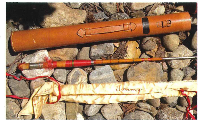
Tom McCall's first outfit, a Montague fly and baitcasting combo presented by his grandfather in 1913.