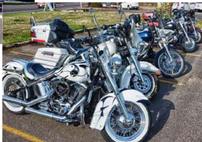
Video of the Drum Circle Tribute: www.wou.edu/~brownk/HOG two files to choose from