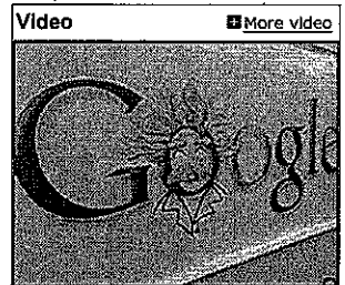
CNN's Alina Cho reports on what's working for workers at Google. (January 27) Play video

Demand for online advertising, particularly the keyword search ads that Google specializes in, has been booming. To that end, Google's top rival Yahoo! (Charts), which is launching a new search platform in order to gain ground it has lost to Google, reported better-than-expected fourth quarter results last week